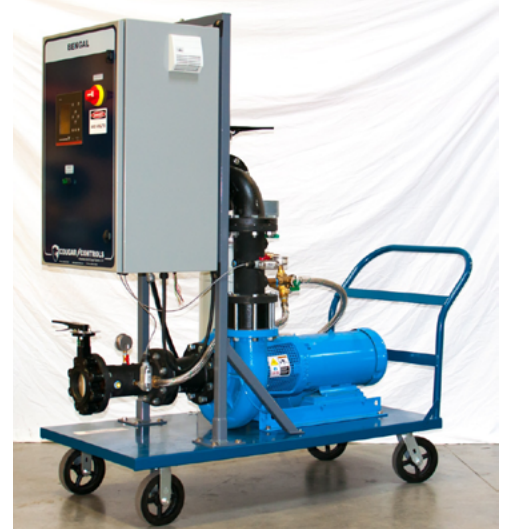
Bengal Rental Pump - Iso View