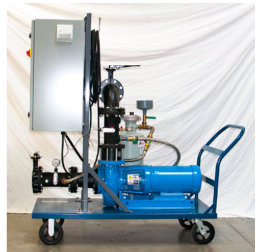
Bengal Rental Pump - Side View