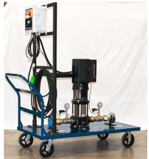
Cheetah CRE Pump - Iso View