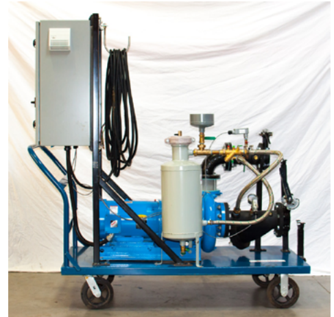
Leopard Rental Pump - Pump Side