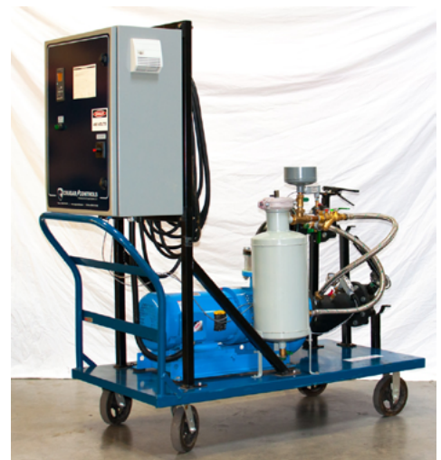
Leopard Rental Pump - Iso View