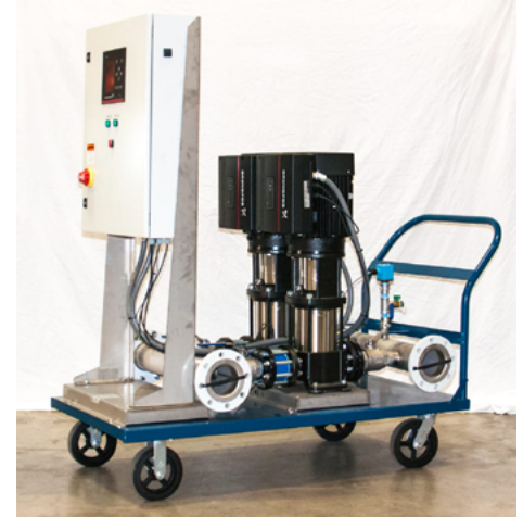
Lion Rental Pump - Iso View