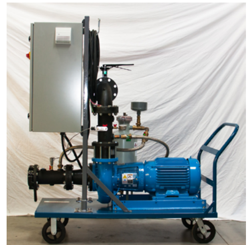
Sabertooth Rental Pump - Side View