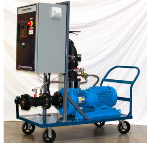
Sabertooth Rental Pump - Iso View